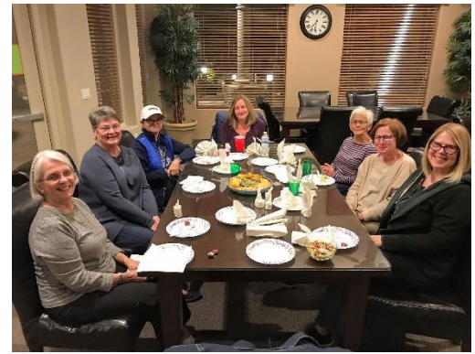
Ladies Night – February 7th

Sunday, March 26th from 1:00 p.m. to 6:00 p.m.